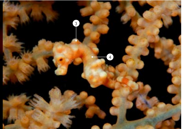
DENISE PYGMY SEAHORSE Hippocampus denise